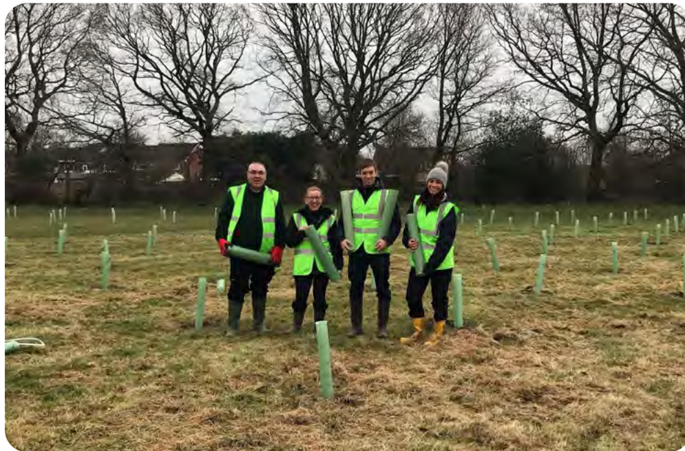
Public realm team planting trees as part of the Planting Our Future campaign

The Council has recently consulted on our draft Air Quality Strategy which details steps we plan to take between 2024 and 2028 to further improve air quality across the borough.