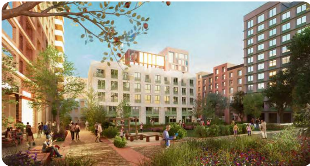
Artist impression of Drury Gardens – part of the regeneration of Mell Square in Solihull town centre

In order to deliver inclusive growth, we will adopt a multi-level approach, pitching national and international benefits to secure investment while delivering local benefits through our place-based leadership.