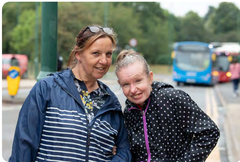
Adult social care officer supporting a service user to travel independently during a travel training session

We are also preparing for the new assurance regime by the national regulator called the Care Quality Commission (CQC) . This assurance process will cover all adult social care functions of councils and following inspections, CQC will award ratings to the local authority (e.g., 'outstanding', 'good', 'requires improvement' and 'inadequate') in a similar way to other social care providers.