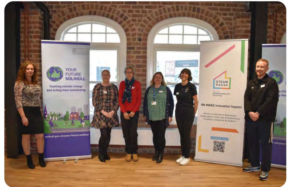
Council officer and representatives from schools in the borough join forces at an event to explore how they can reduce their carbon emissions and play their part in tackling climate change

The Council acknowledges its leadership role to reduce its own emissions with an ambition to be net zero in our own operations by 2030. Our Carbon Budget is considered by the Budget Strategy Group annually to ensure progress against our target. This year we presented our Climate Investment Plan that considers the costs and benefits of climate action.